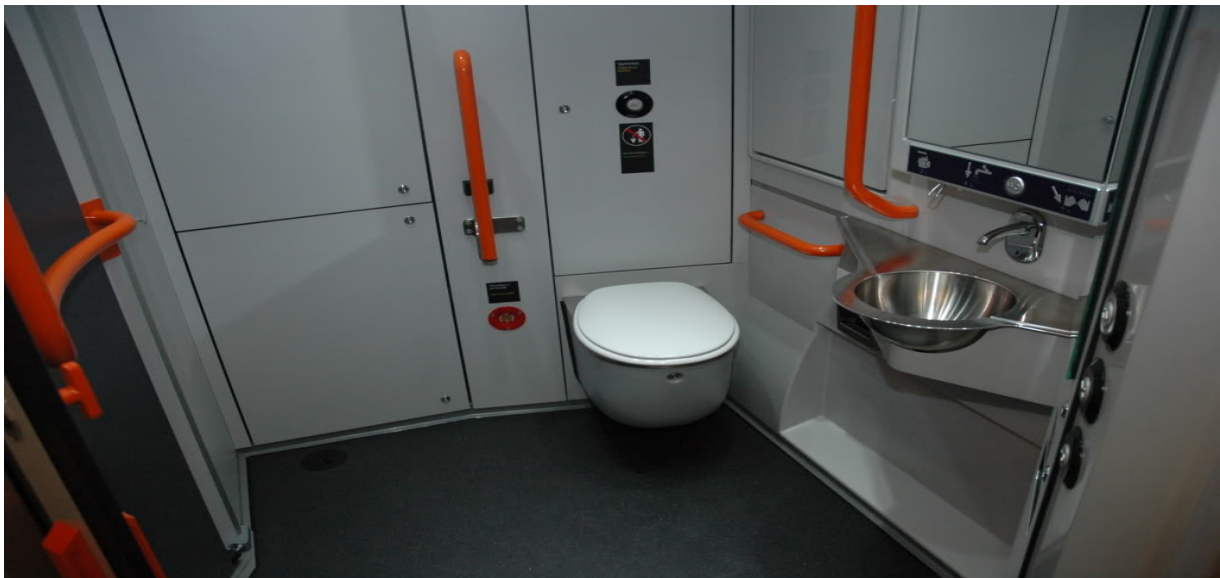
Figure 3. Taken on the train between Lillestrøm and Oslo