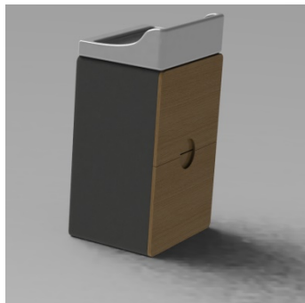
Figure 5. Rendering of such basin